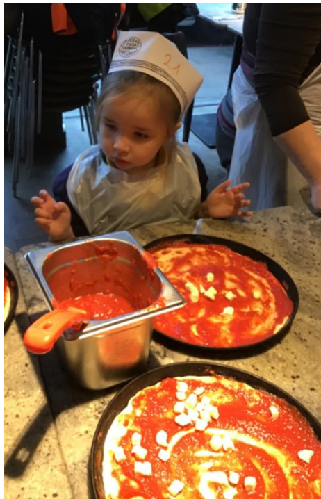
EYFS trips to London Zoo and Pizza Express