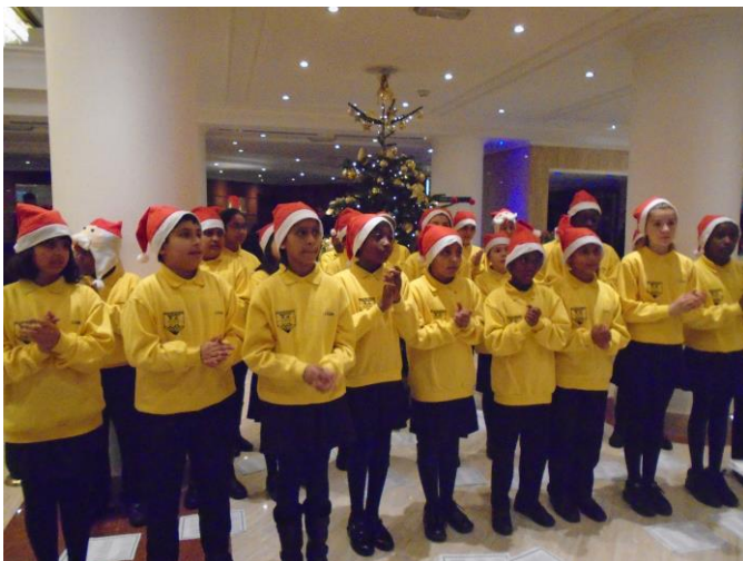
Our Senior Choir singing at the Meliá White House Hotel.

Up to date details of our clubs and musical tuition are provided in our regular newsletters.