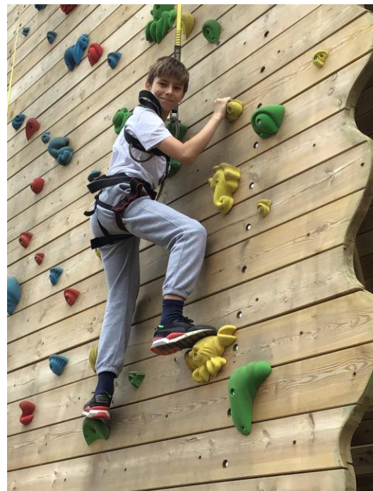
Year 6 School Journey