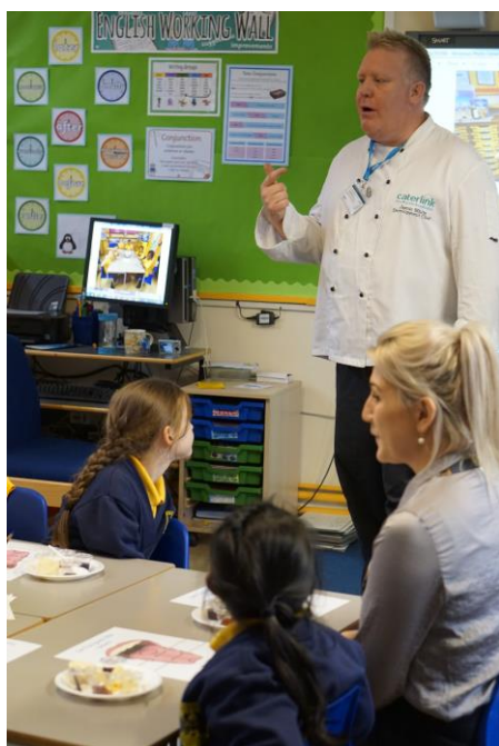
Caterlink teamed up with Christ Church C of E Primary School to discuss healthy eating!