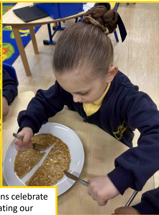
We learnt about Shrove Tuesday and why Christians celebrate Pancake Day. Afterwards we had lots of fun eating our pancakes with our favourite toppings.