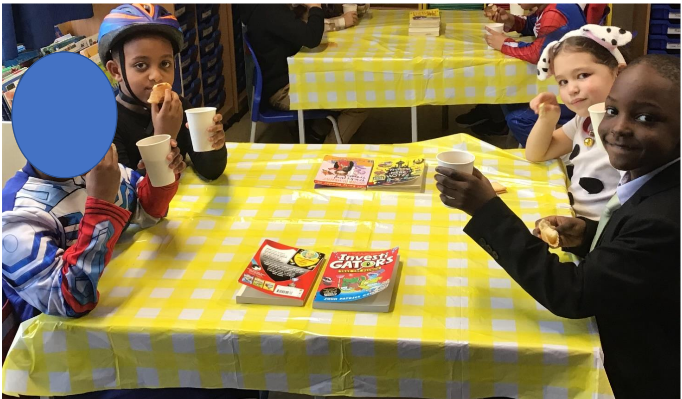
World Book Day Fun!

Our Reading Café opens every Friday morning. During that time, we discuss the book we are currently reading. We also give book reviews to the rest of the class. And of course, we cannot have a café without cake and a drink!! 😊